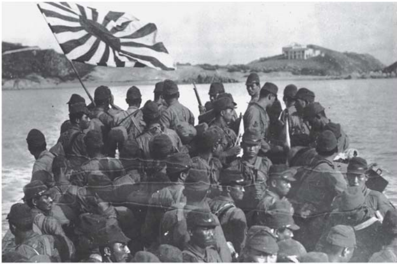
▲ A Japanese landing party approaches the Chinese mainland. The invasion forced Mao and Jiang to join forces to fight the Japanese.

Communist Party leaders realized that they faced defeat. In a daring move, 100,000 Communist forces fled. They began a hazardous, 6,000-mile-long journey called the Long March . Between 1934 and 1935, the Communists kept only a step ahead of Jiang’s forces. Thousands died from hunger, cold, exposure, and battle wounds.