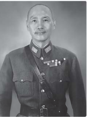
▲ Jiang Jieshi and the Nationalist forces united China under one government in 1928.

The Long March In 1933, Jiang gathered an army of at least 700,000 men. Jiang's army then surrounded the Communists' mountain stronghold. Outnumbered, the